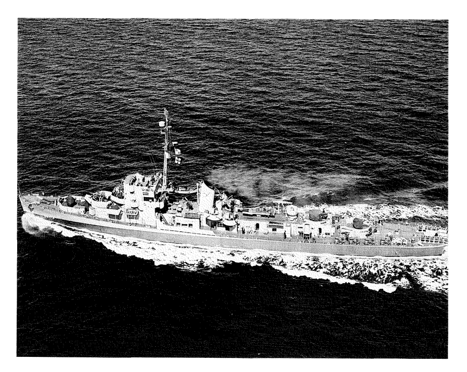
Fig 1 U.S.S. Eldridge (DE 173) on September 12, 1943

tures that made the story compelling. It is our hope that the safeguards drawn from the study can help us recognize patterns this outright fabrication shares with other tales that are: capturing the imagination of paranormal researchers today.