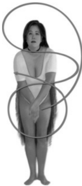
Step 12. Willow Waist