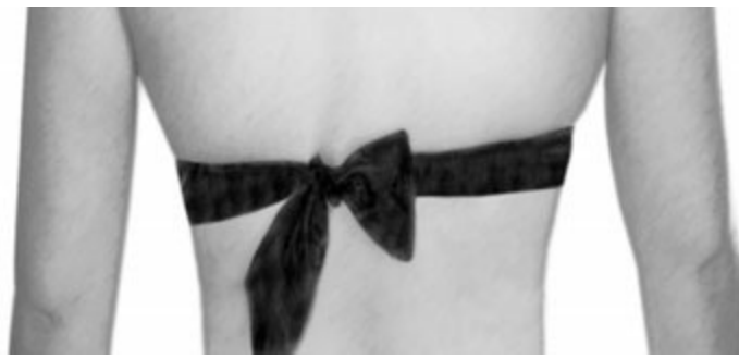
Step 2. Restoring Firmness

The first part of the breast to deteriorate and fall is the upper fleshy part, which causes drooping of the breasts. The second problem is the falling of breasts to the sides of the body, which causes flattening of the breasts. White Tigresses performed special exercises, described below, to help nullify this damage. In addition, the Healing Tigress Exercises were also designed to restore the breasts as well as lighten the menstrual flow.