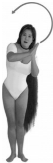
Step 4. Willow Waist