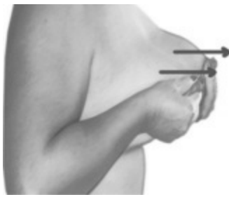
Enlarging the Nipples