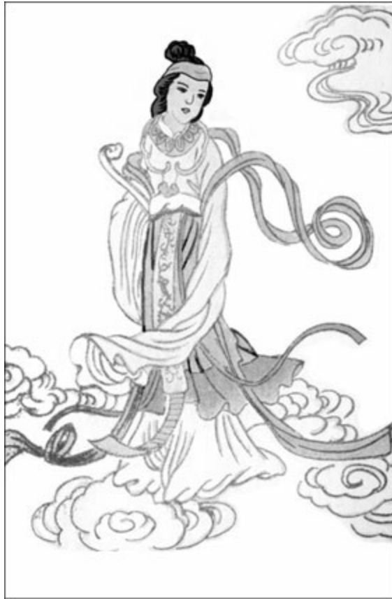
Hsi Wang Mu

No single source can be cited for the origin of the White Tigress practices. They were certainly the product of a cumulative process. Most definitely, however, the teachings were extracted in part from the works attributed to the Yellow Emperor and his three concubines, and from the legends of Western Royal Mother.