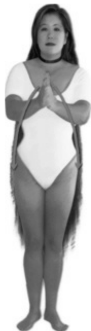
Step 17. Willow Waist

Finally, lower both hands and arms down to the sides of the body (step 18). Weight is held equally on both feet.