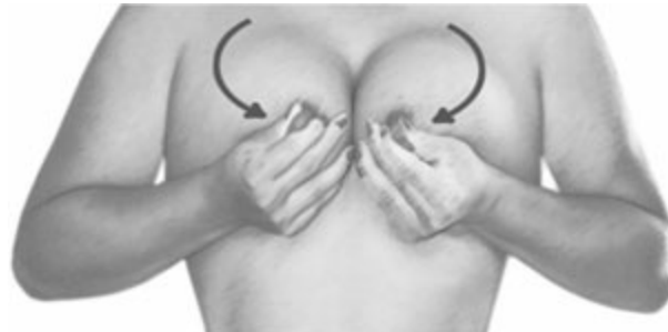
Step 2. Restoring the Breasts