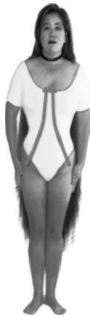
Step 2. Willow Waist