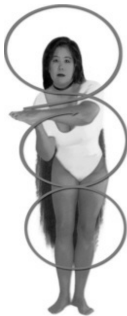
Step 13. Willow Waist

This circling contains three complete breaths. Inhale the first half of the circle (until the hands are stretched up and over the head (fingers pointing straight up), and exhale while bringing the hands and arms down and moving across the front of the body. Inhale during the first half of performing the “S” shape movement and exhale during the last half. Inhale as the hands move up toward the left, exhale as they move up and over the head toward the right in the last circular movement.