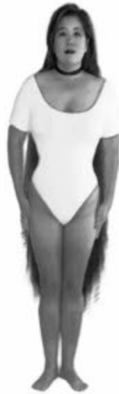
Step 1. Willow Waist

Place the legs together tightly, with the feet held together so that the heels touch each other. Place the hands firmly alongside the body so the fingers touch the outer thighs. Slightly tuck the chin inward so the head is situated straight, and imagine a thread on top of the head lightly pulling it upward (this will straighten the neck). Stand momentarily, smile, and think about being young, while breathing calmly with all the attention placed in the lower abdomen. Breathe at least nine complete breaths to relax and calm the body before beginning the exercise.