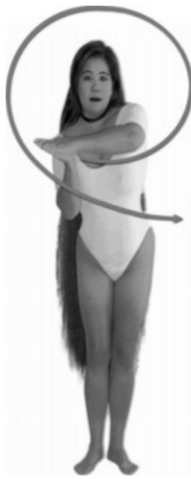
Step 6. Willow Waist

Now trace a full circle with the arms and hands, bringing them down and over toward the left side, and once again up and over to the right side (step 6). Keep the knees slightly bent.