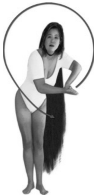
Step 7. Willow Waist