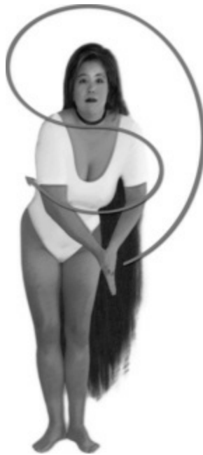
Step 8. Willow Waist

Now, trace another full circle with the hands and arms, bringing them up and over from the left side to the right side, and then across to the left side again. Bend further at the knees, or bend over, to squat somewhat lower than in the last circling movement as you move across to the left side (step 8). Remember that when moving toward the left jut the right hip out to the right, when moving toward the right jut the left hip out to the left, and when coming back across to the left side jut the right hip out to the right.