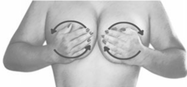
Step 1. Restoring the Breasts