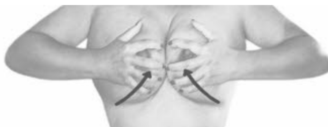
Step 1. Squeezing the Breasts

This exercise strengthens and firms the upper breast, all the milk glands, and the muscle behind the breast. It also aids in making the breasts fuller and more extended.