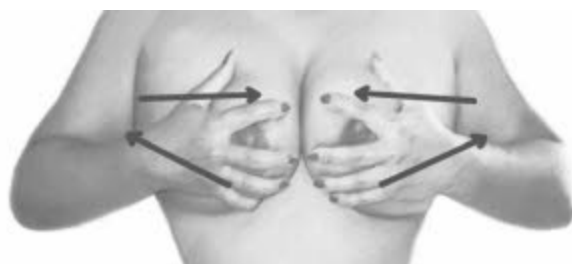
Step 2. Squeezing the Breasts

Again, while seated upright, warm the hands. Place one hand over each breast, with the nipples placed between the index and middle fingers. Squeeze the breasts and pull outward. Do so forty-eight times per day for one hundred days. Be careful not to pinch the nipples between the fingers.