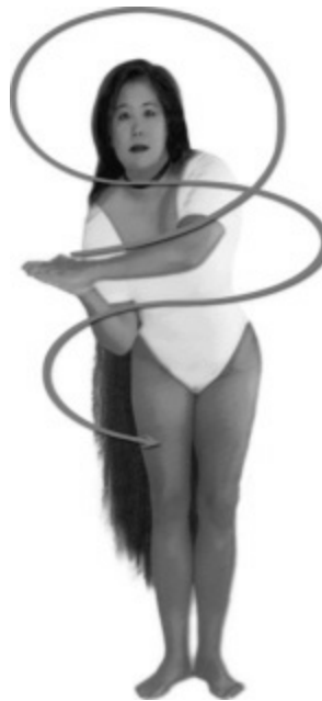
Step 9. Willow Waist

This circling contains one complete breath. Inhale the first half of the circle (until the hands are stretched up and over the head, fingers pointing straight up), and exhale while performing the “S” shape movement.