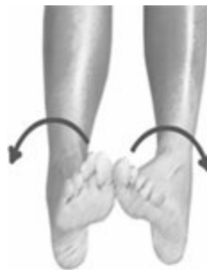
Step 2. Tightening the Vagina