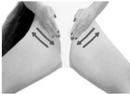
Step 2. Restoring the Ovaries

With attention on the ring and little fingers, massage the ovaries in a circular manner forty-eight times. Next, press in on the ovaries with the ring and little fingers and perform the anal and vaginal lock for twelve breaths. Lastly, just hold the hands in place and perform twelve deep breaths, inhaling through the nose and exhaling out the mouth.