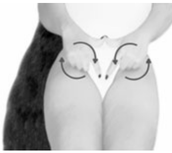
Step 1. Restoring the Ovaries

With attention on the ring and little fingers, massage the ovaries in a circular manner forty-eight times. Next, press in on the ovaries with the ring and little fingers and perform the anal and vaginal lock for twelve breaths. Lastly, just hold the hands in place and perform twelve deep breaths, inhaling through the nose and exhaling out the mouth.