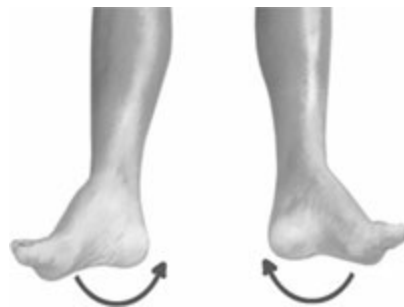
Step 1. Tightening the Vagina

Benefits. This particular exercise is used for tightening the vaginal muscles and increasing sexual energy.