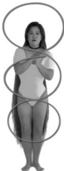
Step 14. Willow Waist

When moving to the left side jut the right hip out to the right, when moving right jut the left hip out to the left. When performing the downward large reverse “S” shape and the large backward “S” shape movements, the hips are to be jutted out to the opposite side of where the hands are moving to, just as is done in all the movements.