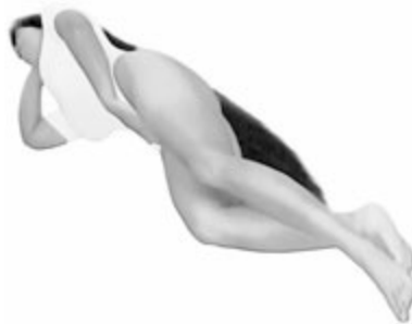
Step 3. Restoring the Ovaries

Benefits. These exercises are designed specially to help regulate and reduce the menstrual flow, to stimulate increased sexual secretions in the vagina, and for the prevention of cysts and other similar problems.