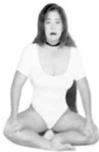
Sitting position. Restoring the Breasts

Sit cross-legged in an upright position. Place a pillow under the buttocks to help raise the hips so the knees can touch the floor. For those familiar with such things, a meditation mat and cushion are best used here.