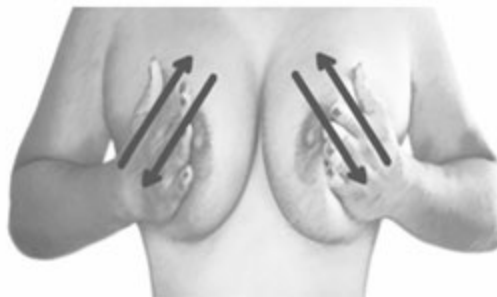
Tightening the Breasts

Sit upright on the edge of a chair. Remove any clothing. Rub both hands together vigorously to make them warm. Place one hand on the outside upper edge of each breast and make firm movements of pressing in and pushing diagonally upward. Do so at least forty-eight times per day for one hundred days.