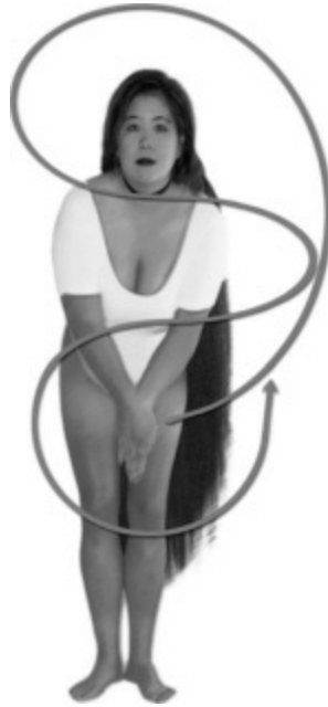
Step 10. Willow Waist

On the descending circular motion make an “S” shape figure with the hands and arms until they reach the relative height shown in step 11, bringing the body up slightly from the lowest position of step 10. Once again, move the hips to the opposite side of where the hands are moving to, as is done in all the movements.