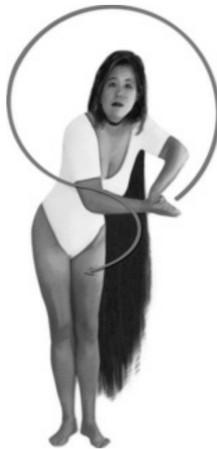
Step 11. Willow Waist

At the end of this circling the fingers are pointing directly out to the left side, with the back of the right palm facing downward. The right elbow and forearm are held parallel to the floor at breast height, and the left elbow points upwards diagonally.