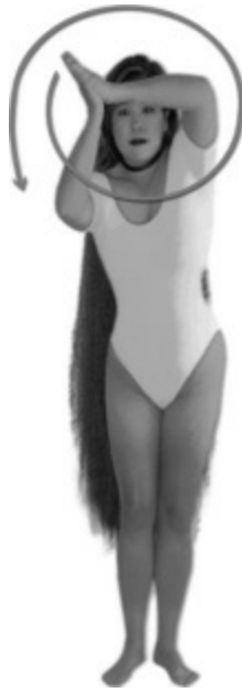
Step 5. Willow Waist

Exhale as the arms and hands are raised upward to this left diagonal.