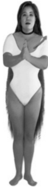
Step 3. Willow Waist

Next, move the arms to the left and raise the right elbow so the forearm is parallel to the floor and the left elbow points directly down (step 4). The palms are positioned at an upward angle. Keep the knees slightly bent. As the arms are lifted, move the head leftward and jut the right hip out to the right.