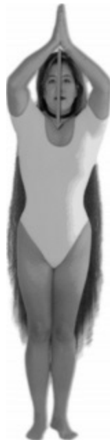
Step 16. Willow Waist

This circling contains three complete breaths. Inhale the first half of the circle (until the hands are stretched up and over the head, fingers pointing straight up), and exhale while bringing the hands and arms down to the front of the body (neck level). Inhale during the first half of the large reverse “S” shape movement and exhale with the last half. Inhale during the first half of the backward “S” movement, exhale with the last half.