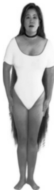
Step 18. Willow Waist

This movement contains one complete breath. Inhale first, without any movement occurring, and then exhale as you lower the arms down along the sides of the body.