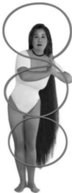
Step 15. Willow Waist

At the end of this “S” formation the fingers are pointing directly upward and held off onto the left side of the body. The right elbow and forearm are held parallel to the floor and the left elbow is held out from the body at breast level.