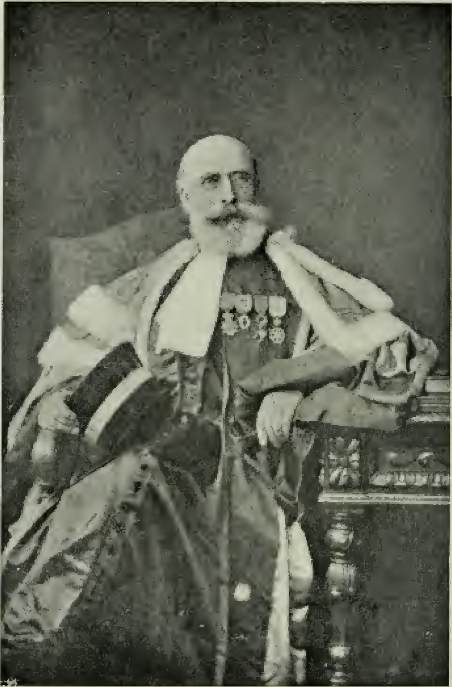
PIERRE JACQUES ANTOINE BÉCHAMP when Professor of Medical Chemistry and Pharmacy at the University of Montpellier 1857-1875